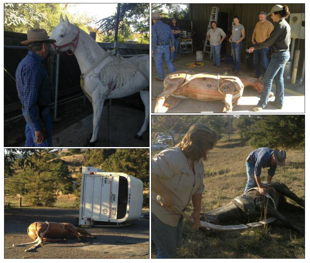
"Lucky" the LAR horse endures a series of unfortunate events.