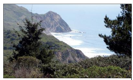
Coast Trail looking over Wildcat Beach.